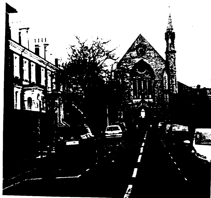
St Barnabas, South Lambeth