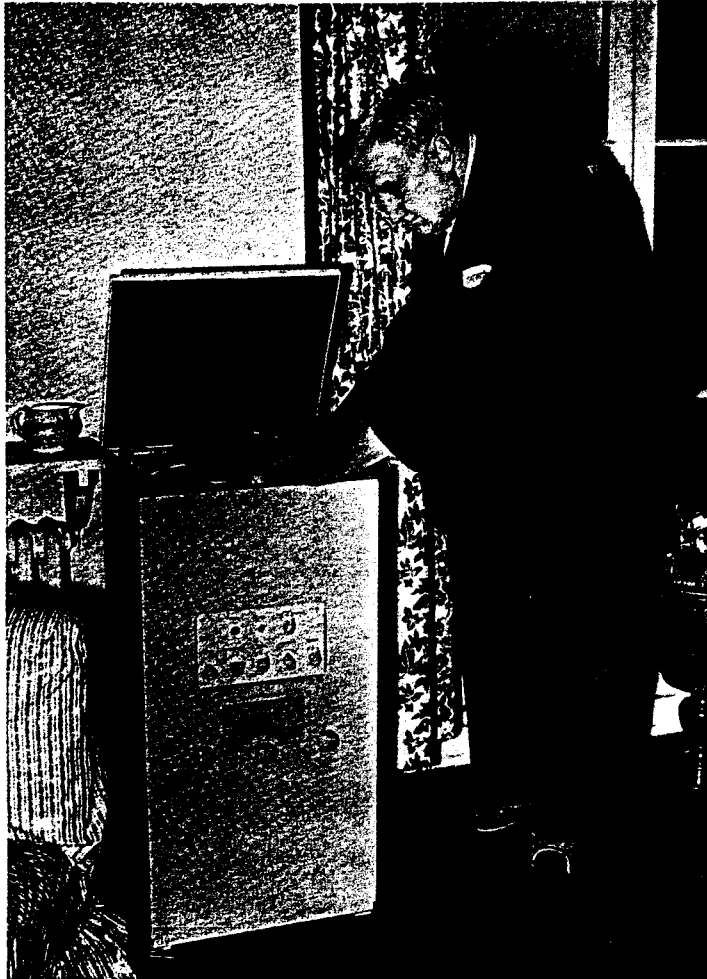
In the 1950s at Hanover Terrace