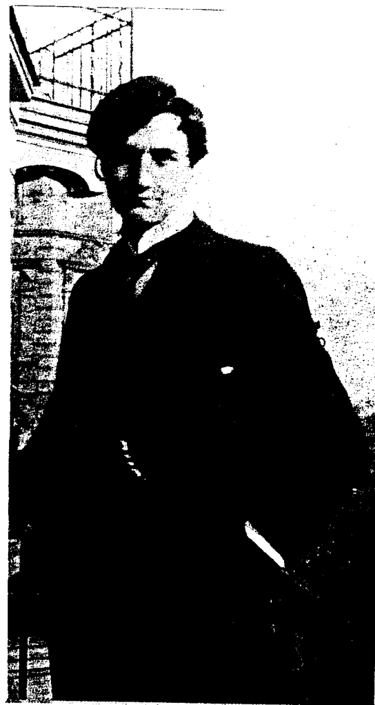
In the 1890s